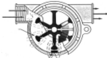
Hall-Effect-Sensor sends a voltage pulse with each pass of magnetic field

popularised the Rotor-Flow's paddlewheel design by combining high visibility rotors with solid-state electronics that are packaged into compact, panel mounting housings. They provide accurate flow rate output with integral visual confirmation ... all with an unprecedented price/performance ratio.